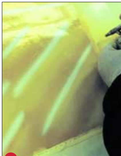
6 I airbrush white across the vinyl.