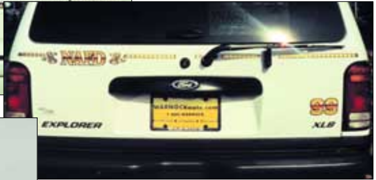
The completed Chief's car, showing the hood, trunk and side.