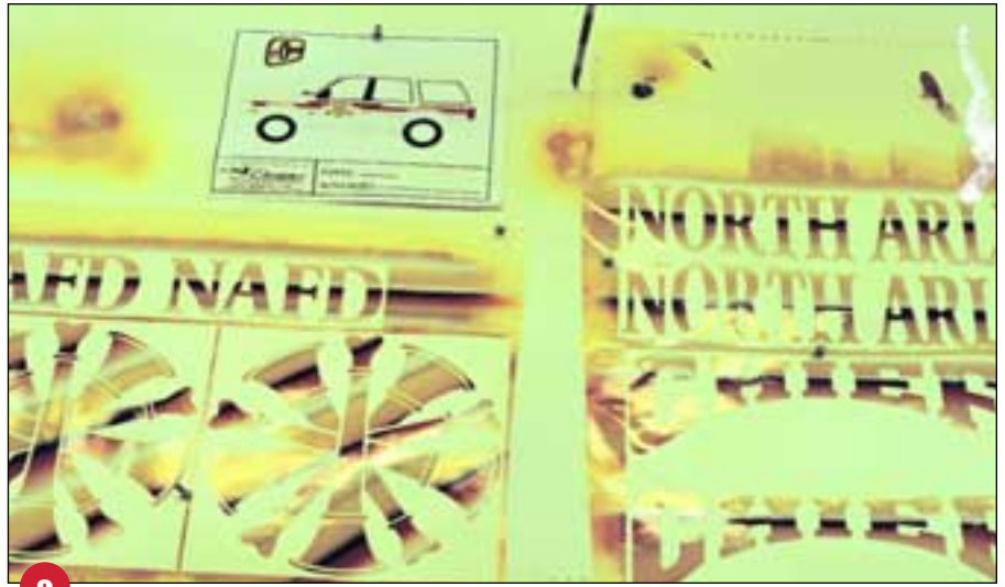
9 I usually like to wait only about 15 to 20 minutes before I weed out the vinyl. Remember if you wait too long, you run the risk of the paint drying over the cut lines and tearing up the lettering. Never weed the vinyl before all the airbrushing is finished! If you do, the liner will be full of the paint and when you apply the transfer tape it will pick up the paint and put it on the surface of the vehicle or sign. You can see the sketch that I used to sell the job at the top of the photo.