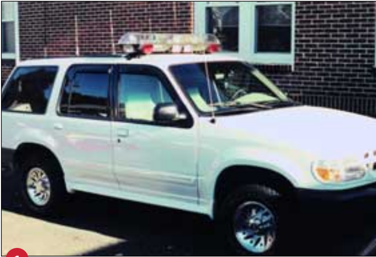
1 This is a brand new Ford Explorer that the town of North Arlington brought to me to have lettered and striped for their Fire Chief. Since I already have the sketch approved, I can start by prepping all the areas that will be lettered and striped. I use Rapid-Tac's Rapid Remover to remove any wax or other contaminants from the truck's surface.