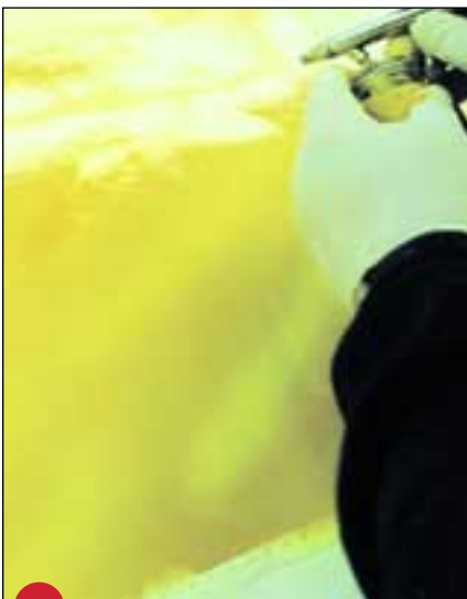
5 This color is lemon yellow with some imitation gold added to it.