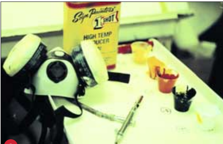
3 In this photo I thought that I'd show you some of the material and equipment that I used for this project. In the center is the Iwata Eclipse airbrush. To its left is my charcoal respirator that I wear for all airbrushing, at the top is 1 Shot high temp reducer (mix the lettering enamel at a ratio of 60% reducer to 40% enamel) and last but not least are the airbrush colors.