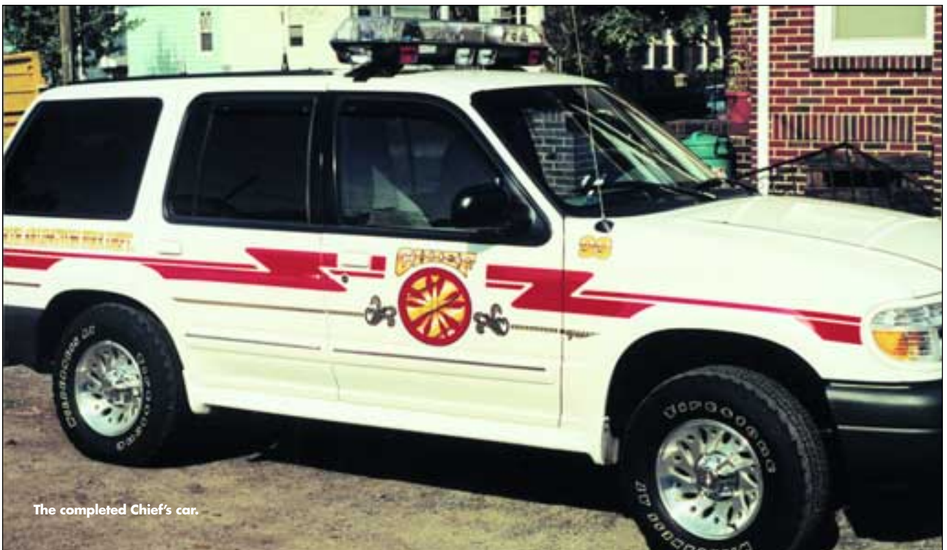
The completed Chief's car.