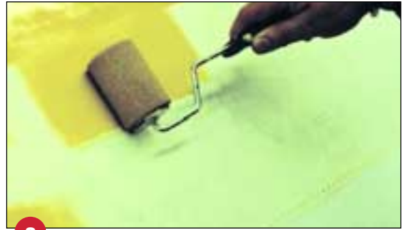
2 I'm using clear enamel receptive vinyl to paint all of the airbrush lettering. Using my Vinyl Express Panther 30" plotter, I first pen plot the layouts onto the vinyl. Next I cut the layouts going right over the pen plots, so that I can see the layout through the enamel that I'll roll on later. (This will help when I airbrush the vinyl.) A 3" foam roller is all you need to paint with. I add a couple of drops of 1 Shot hardener and a small amount of their low-temp reducer to their imitation gold lettering enamel. Remember to roll out ALL bubbles left by the roller. Take the roller, and using just the weight of it, roll it over the paint to smooth it out. Note: If you look closely, you'll see the pen plot on the bottom of the vinyl.