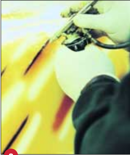
8 Here's the last color to be applied. It's straight black.