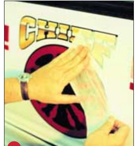
12 Now the airbrushed vinyl is applied wet.