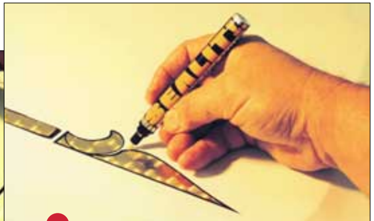
14 Here I'm using my Sealit pen to seal the edges of the Sign Gold. This pen contains 1 Shot acrylic clear. It really works.