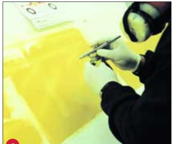
4 I wait about 15 minutes for the enamel to tack up. The first color is a mix of lemon yellow and white. I'm going for a gold metallic effect. Note that I'm wearing my respirator and latex gloves. Not visible is an exhaust fan to eliminate the paint fumes.