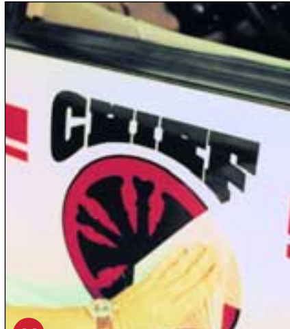
11 The red circle and black outline of the Chief's horns are applied.