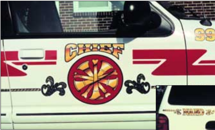
The finished doors, complete with air-brushing, and Sign Gold striping.